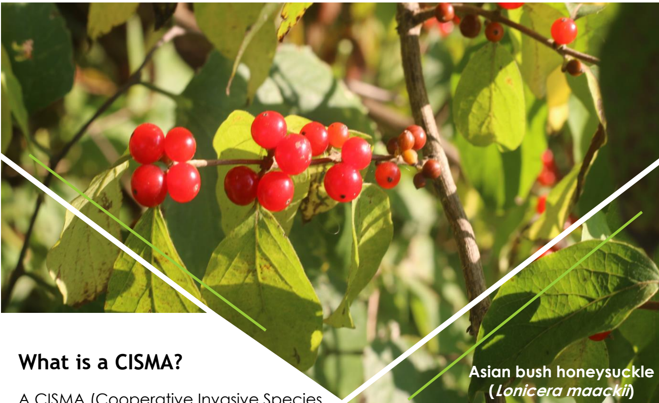
Asian bush honeysuckle ( Lonicera maackii )