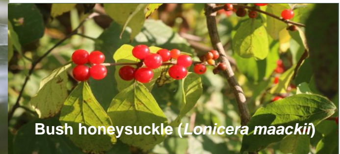
Bush honeysuckle ( Lonicera maackii )

Have an invasive species specialist come to your property and identify invasive plants that might be growing on your land. We can help you control problem plants. Visit http://www.sicim.info/cisma-project/#iiccontacts to request a survey