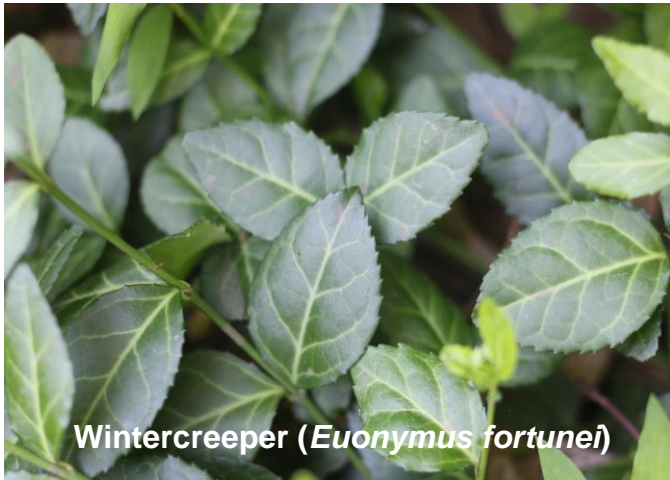
Wintercreeper ( Euonymus fortunei )

The Perry/Spencer Land and Native Species Team provides resources to Perry and Spencer County citizens to help them identify, manage, and report invasive species on their properties. PLANT also serves as part of the early detection and rapid response network to be the first line of defense against new invasive species moving into Indiana via the Ohio River. PLANT hosts regular field days and workshops to educate the public on invasive species, native species for landscaping, and native species for pollinators. Please visit our website or like us on Facebook for updated information on our events.