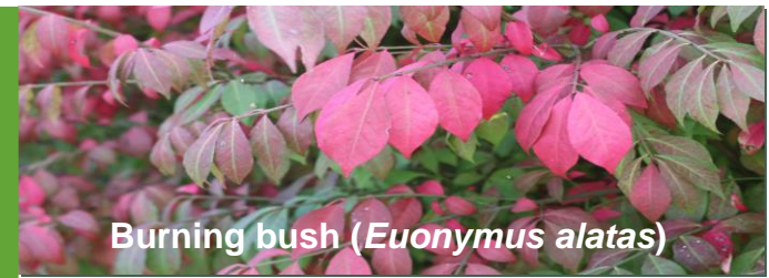
Burning bush ( Euonymus alatus )

Invasive species hurt wildlife by crowding out the native plants that our wildlife need for food and cover. This reduces the number and variety of forest wildlife available for hunting and recreation. Invasive species can make a nice hike through fields and forests a painful walk through a tangled thorny mess. Invasive species can also become a weedy nuisance in a garden or in landscaping.