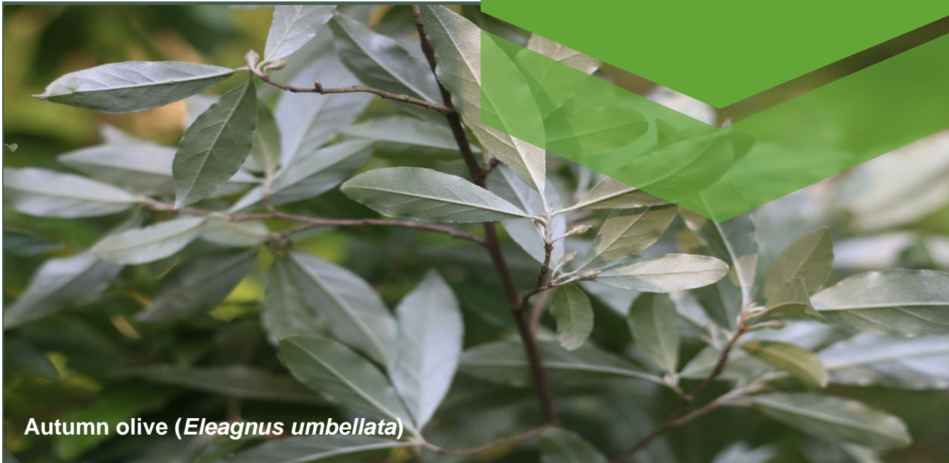
Autumn olive ( Eleagnus umbellata )

A species that does not naturally occur in a specific area and whose introduction does or is likely to cause economic harm, environmental harm, or harm to human health. Asian bush honeysuckle (pictured bottom right) is one of the most prevalent invasive species we have in Perry & Spencer County.