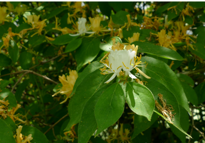
Asian Bush Honeysuckle (shrub) Lonicera spp.