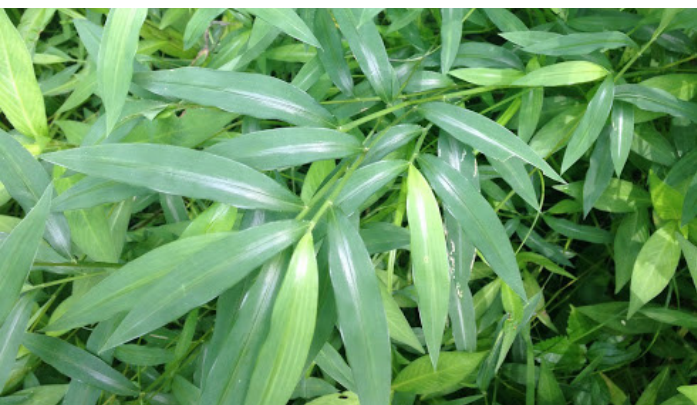
Japanese Stiltgrass (grass) Microstegium vimineum