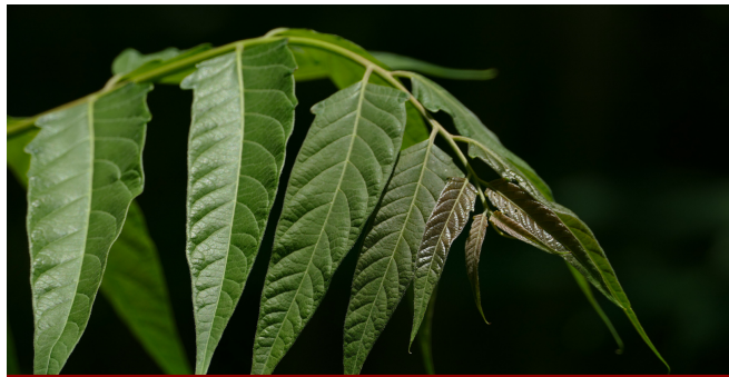
Tree of Heaven Ailanthus altissima

Indiana Native Plant Society IndianaNativePlants.org