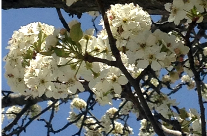
Callery pear (tree) Pyrus calleryana