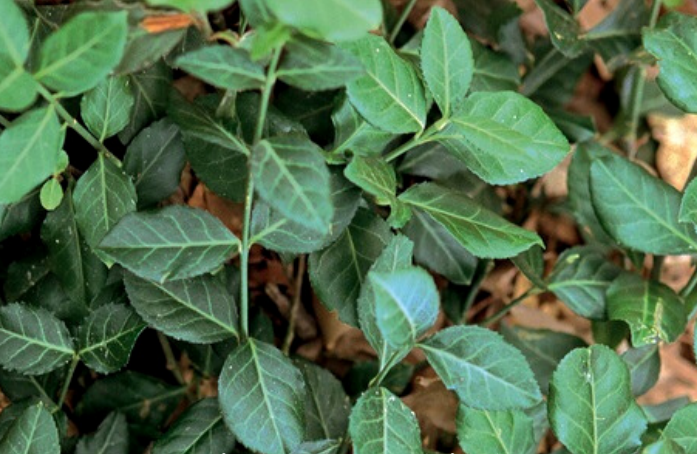
Wintercreeper (vine) Euonymus fortunei