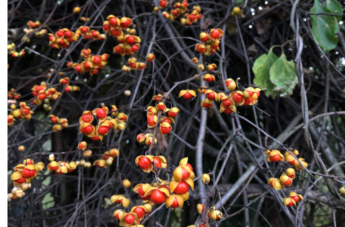
Oriental bittersweet (vine) Celastrus orbiculatus