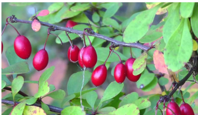
Japanese barberry (shrub) Berberis thunbergii