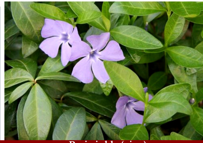
Periwinkle (vine) Vinca minor